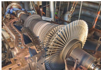
Inspection of a 6 MW turbine