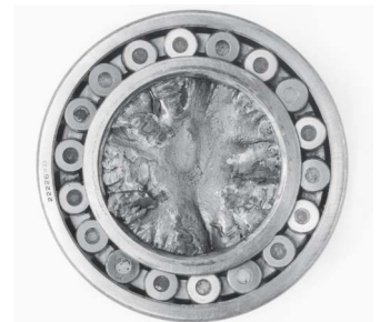
Broken rotor shaft of a cutting mill with roller bearing