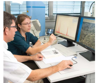
Fracture surface analysis in the scanning electron microscope