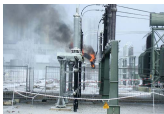
Ignition of a burst cable sealing end for a 110 kV transformer